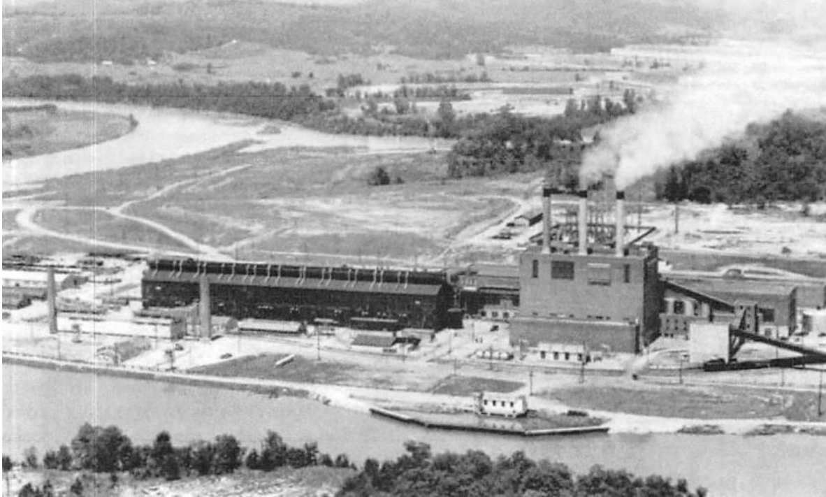
S-50 Liquid Thermal Diffusion Plant (long, dark building) The adjacent K-25 power plant shown with 3 smokestacks drew water from the Clinch River Clinton Engineer Works, 1945. Public domain (Courtesy of Barbara Scollin)

Diffusion columns, S-50 Thermal Diffusion Plant, Clinton Engineer Works, 1945. Public domain. (Courtesy of Barbara Scollin)