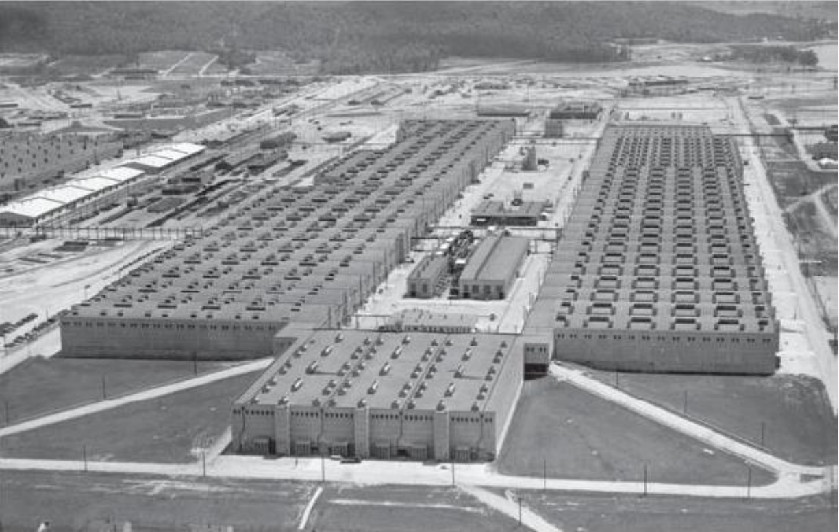
K-25 Gaseous Diffusion Plant, foreground, the largest building in the world at that time. K-27 extension unit subsequently erected adjacent to Poplar Creek, at the upper right. Clinton Engineer Works, 1945. Public domain. (Courtesy of Barbara Scollin)

(As published in The Oak Ridger's Historically Speaking column the week of April 28, 2025)